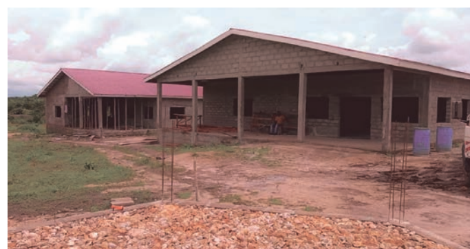
From top: Aerial view of our Child Protection Center; Girls home, family home, and the foundation of the gazebo