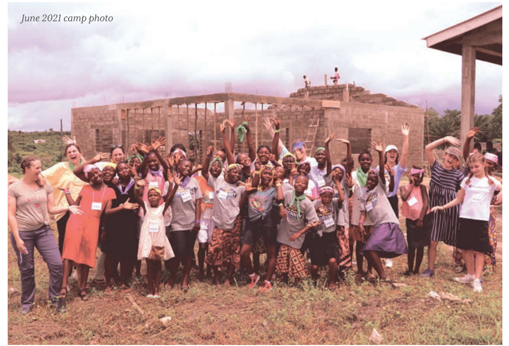
June 2021 camp photo